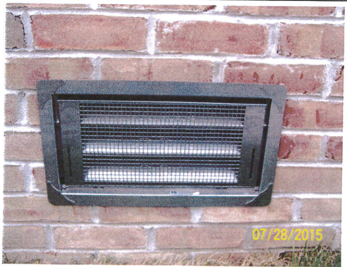
Vent View – Date of Photograph: (See Photo Stamp)